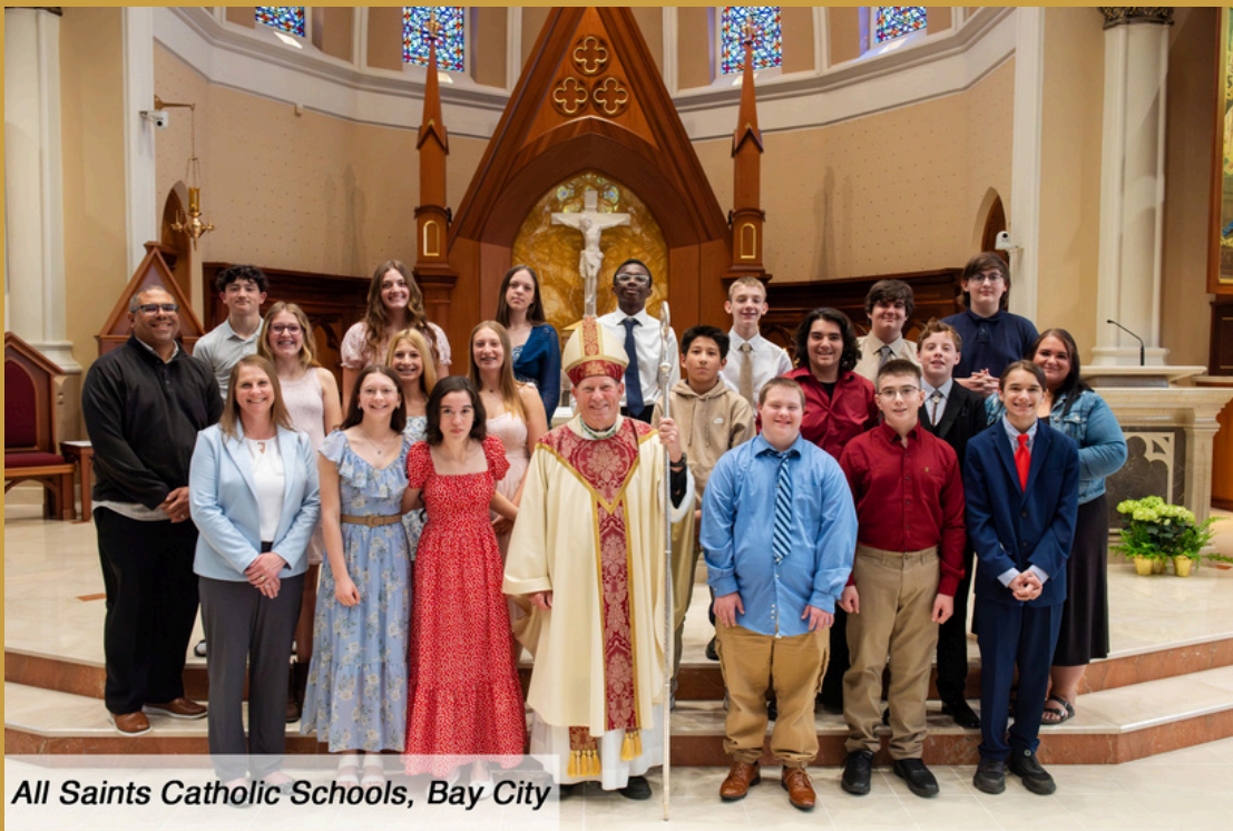
All Saints Catholic Schools, Bay City